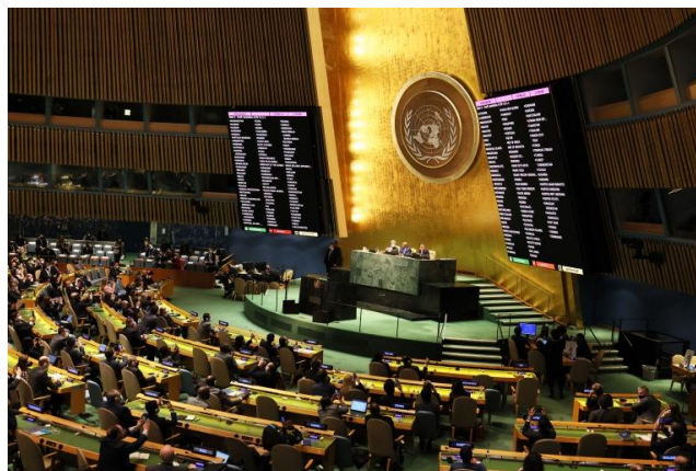
Members of the General Assembly approved the resolution during a special session of the