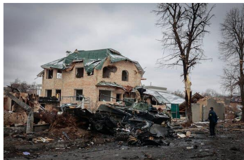
The remains of Russian military vehicles in the town of Bucha, close to Kyiv, Ukraine.

Explosions struck the capital, Kyiv, and an apparent rocket strike destroyed an administration building in Kharkiv, the second largest city, killing civilians. [16]