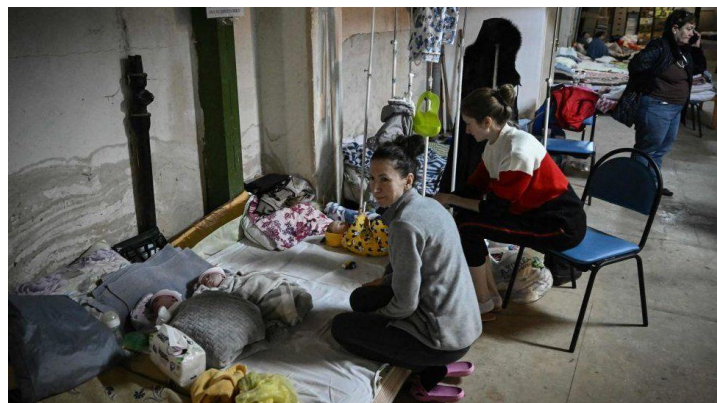
The paediatrics ward of this Kyiv hospital was forced to shelter in the basement as Russian forces attacked

Nato's defensive alliance has made clear there are no plans to send combat troops to Ukraine itself. But member countries have provided weapons and field hospitals and the EU, for the first time in its history, is to buy and send arms and other equipment.