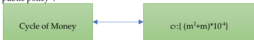
Figure 1. Cycle of money for c_y: \{(m^2+m) \cdot 10^{-4}\}

The policy that supports the money cycle is the regulatory policy, which has more accurate results without the side economic effects of interventionism or even the free market. The present research studies the case of the money cycle, as formulated by the current literature [1]: "This paper analyzes the case of the cycle of money with and without the escaping savings. The same procedure is followed for the enforcement savings [2-14]. This could happen when there are returned savings and when there are no returned savings. This economic comparison has as a result that in a market consumption and investments in combination with savings have an important role, subject to the public and the tax policy [15-24]. Therefore the appropriate tax rate is the key element for the appropriate public policy".